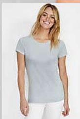
MARTIN WOMEN 02856