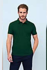
PERFECT MEN 11346