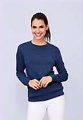
SULLY WOMEN 03104